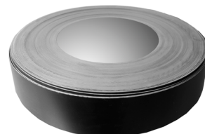
4" Roll @ 100' - Part No. 10140