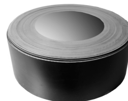
5.5" Roll @ 100' - Part No. 10141