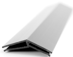
45° Profile - Part No. 10134