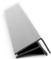
90° Profile - Part No. 10132