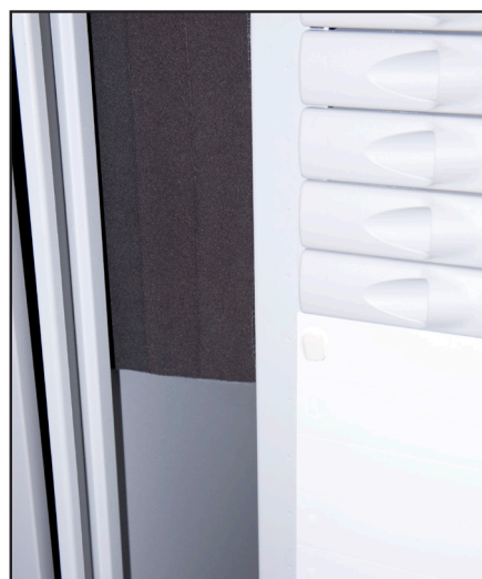
Seals Gaps on 800mm Racks Image Shows With and Without Air Barrier