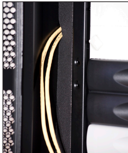
Seals Gaps on 600mm Racks Whilst still allowing cable access