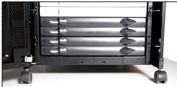
Rack With No Seal Air can freely flow under rack