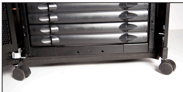
RackSEAL Applied To Base of Rack Once applied barrier starts to expand