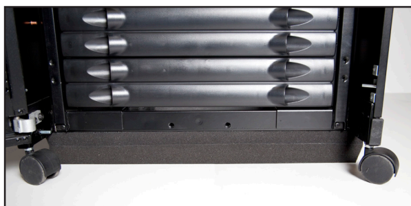
RackSEAL Expanded Under Rack RackSEAL Air Barrier seals gap blocking bypass airflow