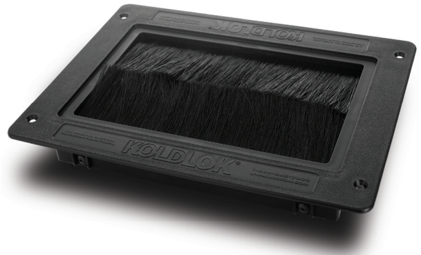
Figure 1. KoldLok® Integral Brush Grommet Part No. 1010

A key question remains: to what extent does the choice of grommet affect a data center's efficiency and operational expenses?