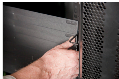
Place the panel in the required position and align the clips with 19" mounting holes