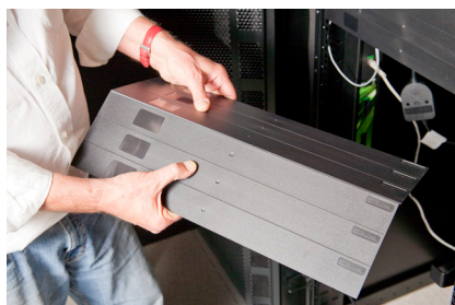
...fold backward and "snap" off as required.