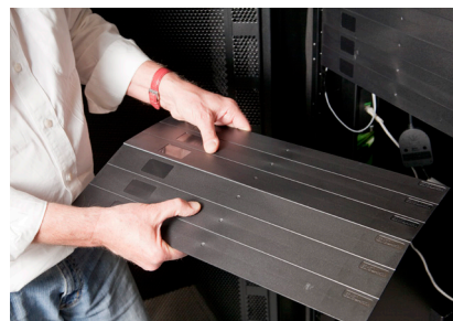
Easy selection of individual panel combinations. Firmly bend along desired position...