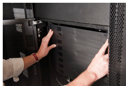
Insert the adjusted panel to fill the remaining open rack space.