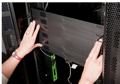
Push the clips firmly into position on each side