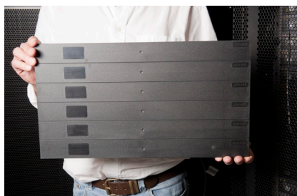
EZIBLANK® Installation, 6 x 1U Panel